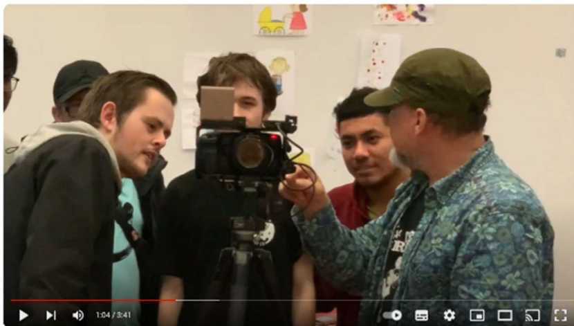
iSkills: Assemblage - Lets Assemble Together

The 'Assemblage' men's group is attended by a regular cohort of 10 men each week. We received funding from Bernicia Foundation of £5,550 to help get the group set up.